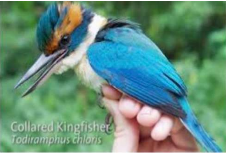
Collared Kingfisher Todiramphus chloris